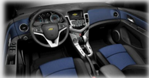
OEM / Tier 1