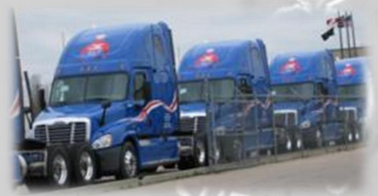
Fleet/ Truck / Bus